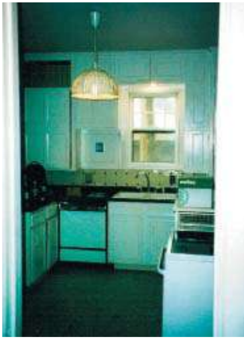
Outdated and confining turns into light and airy.