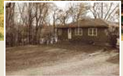
Fatima groom from above: A tiny house in a great location undergoes a metamorphosis to become a stunning lake home.