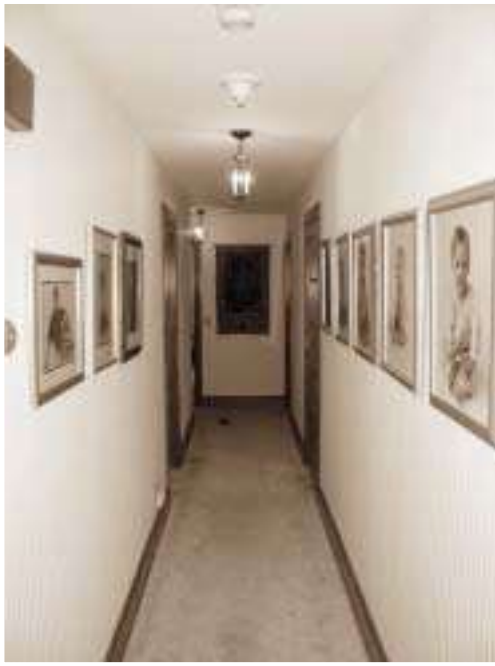
The long, confining hallway was opened up with columned elegance.