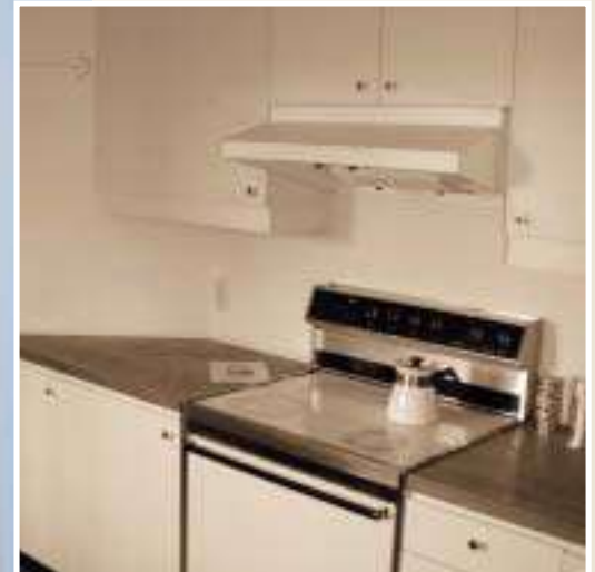
A plain, non-descript kitchen was transformed into an open, gleaming masterpiece.